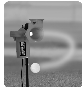
Left Handed Sliders