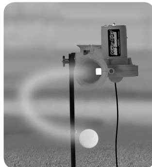
Right Handed Sliders