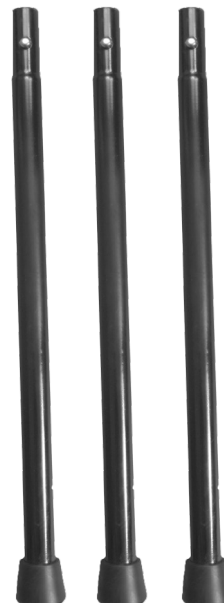
Bottom Leg (E) 3x