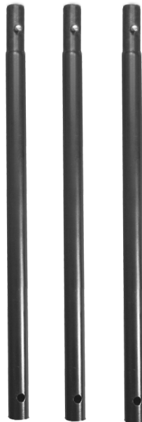
Top Leg (D) 3x