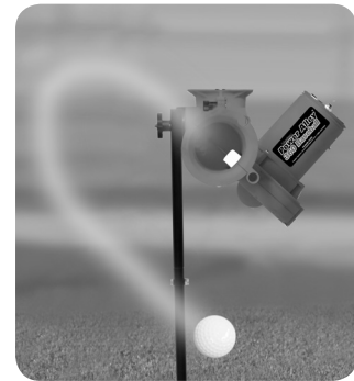
Right Handed Curves