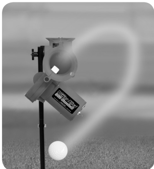
Left Handed Curves