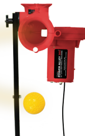
Right Handed Sliders