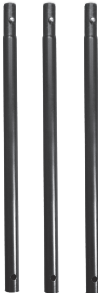
Top Leg (D) 3x