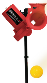
Left Handed Curves