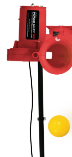
Left Handed Sliders