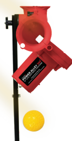
Right Handed Curves